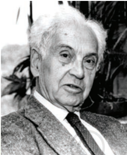
Ernst Mayr (1904 – 2004)

Born on 5 July 1904, in Kempten, Germany, ERNST MAYR, the Harvard University evolutionary biologist who has been called 'The Darwin of the 20 th century', was one of the 100 greatest scientists of all time. Mayr joined Harvard's Faculty of Arts and Sciences in 1953 and retired in 1975, assuming the title Alexander Agassiz Professor of Zoology Emeritus . Throughout his nearly 80-year career, his research spanned ornithology, taxonomy, zoogeography, evolution, systematics, and the history and philosophy of biology. He almost single-handedly made the origin of species diversity the central question of evolutionary biology that it is today. He also pioneered the currently accepted definition of a biological species. Mayr was awarded the three prizes widely regarded as the triple crown of biology: the Balzan Prize in 1983, the International Prize for Biology in 1994, and the Crafoord Prize in 1999. Mayr died at the age of 100 in the year 2004.